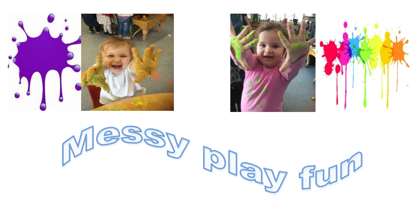
UNCRC Article 31 - All children have the right to play.

The Nursery and 2 Year Olds love to get messy! Here are some photographs that show what was on offer during our last messy play session. The children were encouraged to have fun and explore, to talk about and mix the wide range of media on offer. For this sensory play session we used cornflour, clay, shaving foam, jelly, finger paints and flour.