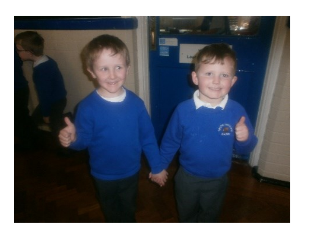
UNCRC Article 31 - The right to play.

Well done to all the children who achieved 100% attendance over the Spring Term. The children behaved exceptionally well at the recent disco and taught each other new dance moves, including, 'The Floss!'