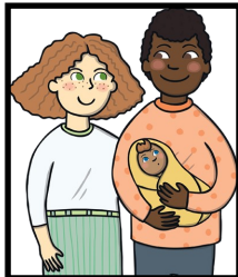
Mum and Dad