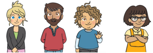
Mum Dad Brother Sister