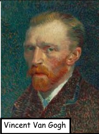
Vincent Van Gogh

Van Gogh was an artist. He made line drawings and explored different techniques.