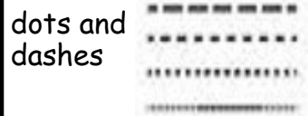
dots and dashes