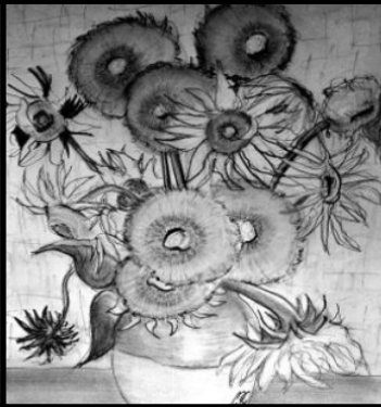
tone and blend