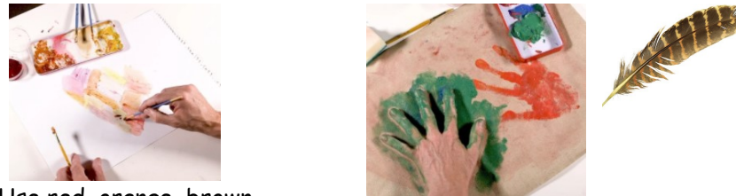
Use red, orange, brown and white tones.

We will experiment with colours and effects by using different shades, tones and tints, and selecting different resources to paint with.