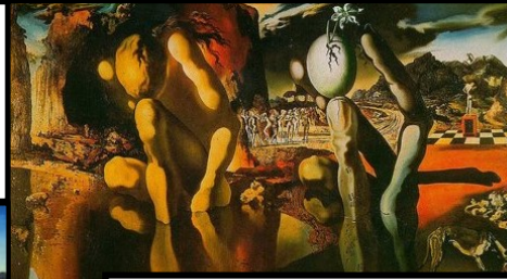
Metamorphosis of Narcissus

There are lots of different grades of pencils we can use to add shade and tone to our art.