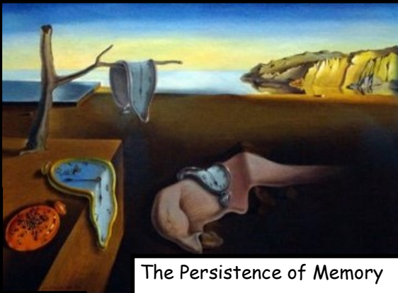
The Persistence of Memory

Salvador Dali was best known for his work on surrealism. He used the visions he saw in his dreams and created them through art.