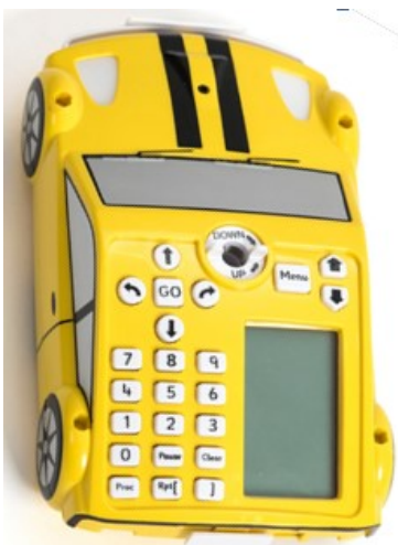
Top view of the Pro-Bot