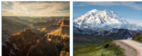
Grand Canyon Denali Mountain