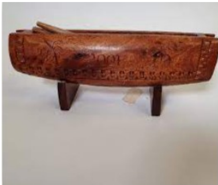
Carved Wood Aitutaki Drum ...