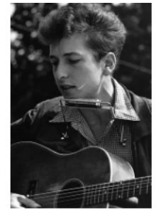
Bob Dylan is one of the most influential performers in American music.

CRC Article 29: All children have the right to have their talents developed to the full.