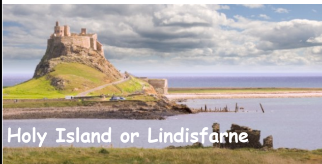
Holy Island or Lindisfarne