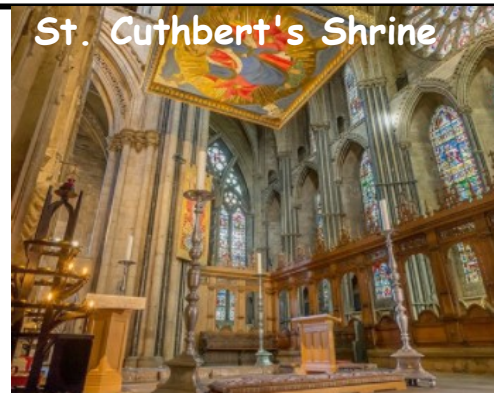
St. Cuthbert's Shrine