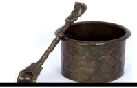
spoon and water