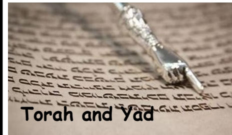
Torah and Yad