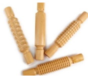
rollers for shape and patterns