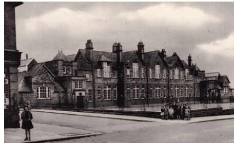
Our school now.