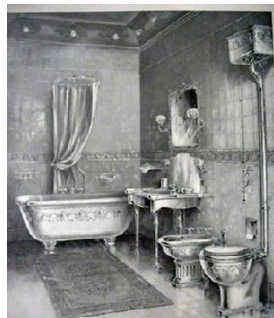
A Victorian bathroom.