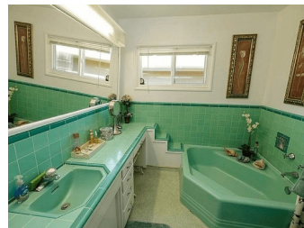
A 1950s bathroom.