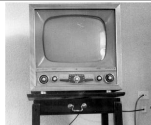
A 1950s television set.

CRC Article 17: All children have the right to sources of information.