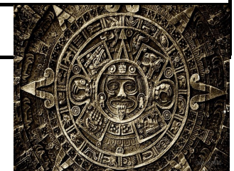
The Mayan calendar.