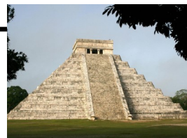
A Mayan pyramid.

The Mayans were very advanced compared to people living in Britain at the same time and can be compared to the ancient Egyptians and ancient Greeks in terms of their technology, buildings and beliefs.