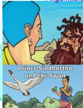
Prince Siddhartha and the Swan