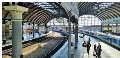
a railway station