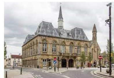
a town hall