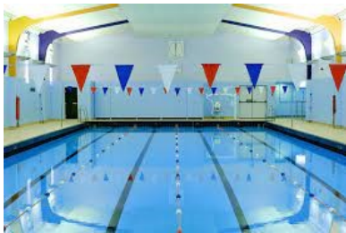
a swimming pool