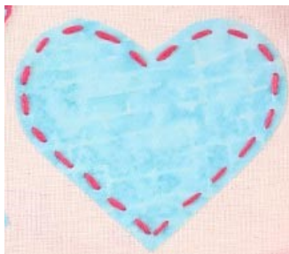
sewing on your applique