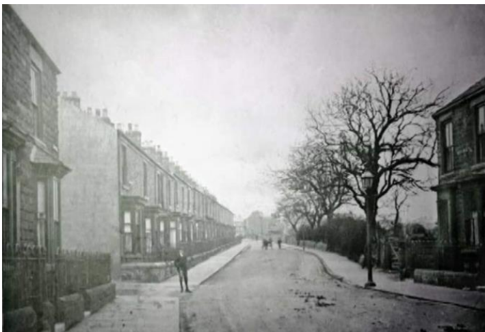
The view facing up Byerley Road before the school was built.

Even more amazing is this wonderful picture of Byerley Road before the school was even built!