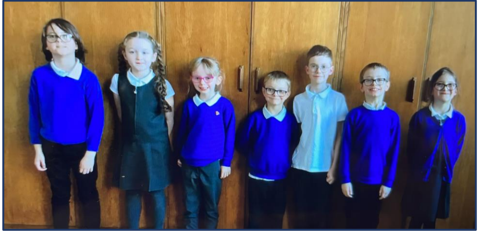
This paper is produced by the budding reporters of Timothy Hackworth's brand new Newspaper Club.

We hope you enjoy this issue and all of the issues to come!