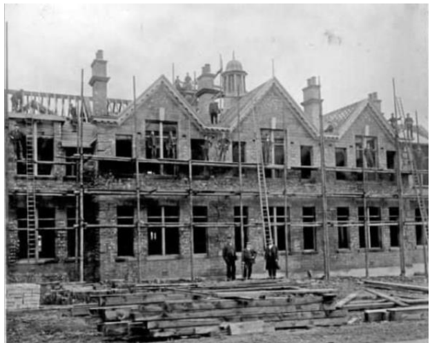
Timothy Hackworth Primary as it was being built in 1910.

The school opened in 1910 to accommodate the ever-increasing population of New Shildon Council School (now Timothy Hackworth Primary School).