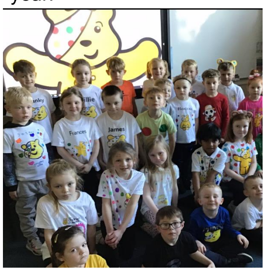
1/2T raised money for Children in Need.

As a Gold Level Rights Respecting school we work to enable all children to access their rights. As the Timothy Hackworth Child believes in tolerance, acceptance and equality, we take part in several charitable events each year.