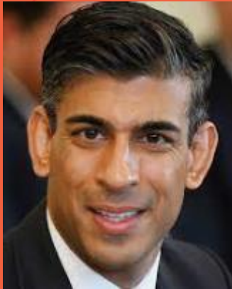
The Prime Minister: Rishi Sunak

Yes (but not on their own!). They are the leader of the Government. They can introduce new laws and changes to the law to the House of Commons to be debated and voted on.