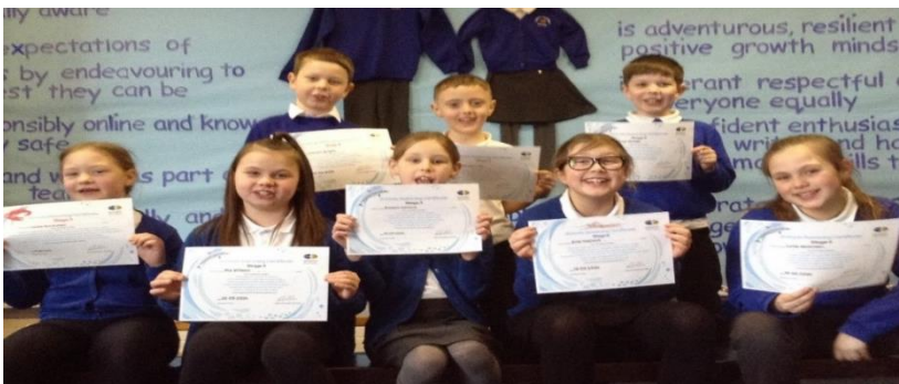
Year 4 gained vital life skills.

Year 4 children took part in swimming classes every Friday during the Spring Term. The children have made remarkable progress whilst