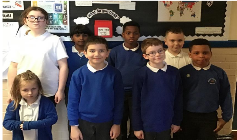
This paper is produced by the budding reporters of Timothy Hackworth's Newspaper Club.

Welcome to our third issue of The Timothy Hackworth Times; produced by pupils, for pupils. Each week, our fantastic members of Newspaper Club have been learning the skills required to become budding journalists. We hope that you enjoy this issue and all of the issues to come!