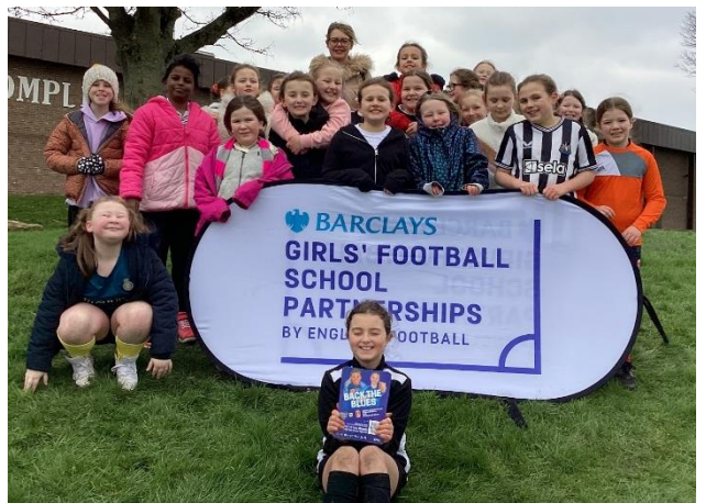
Year 4 worked as a team at the girls football event.