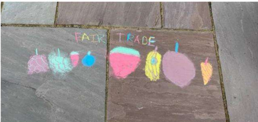
chalk art by Frankie, age 7

It's environmentally friendly and after it's done its job it will wash away!